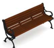
Ipe Wood Slats